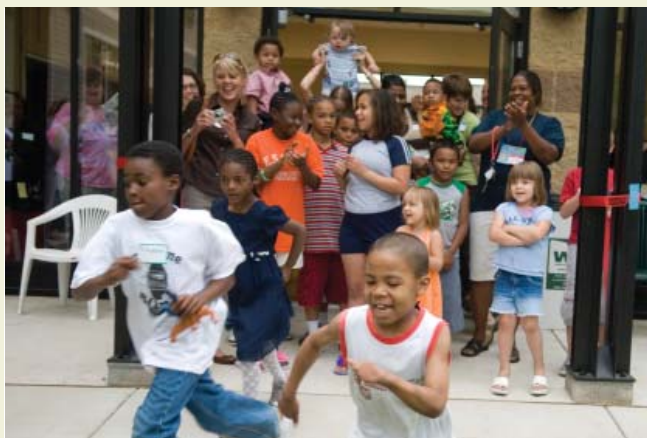
A clear highlight of the June open house was the ribbon cutting on a playground built for 63 young Camden residents by more than 30 Faegre and Benson volunteers.