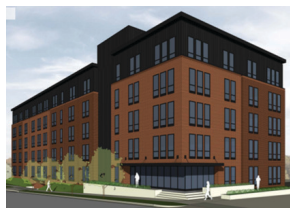
Nellie Francis Court