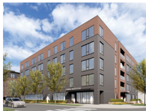
Emma Norton Residence